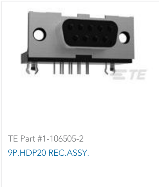
TE Part #1-106505-2 9P.HDP20 REC.ASSY.