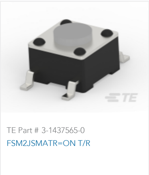
TE Part # 3-1437565-0 FSM2JSMATR=ON T/R