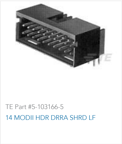
TE Part #5-103166-5 14 MODII HDR DRRR SHRD LF