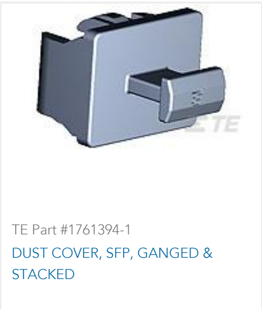
TE Part #1761394-1 DUST COVER, SFP, GANGED & STACKED