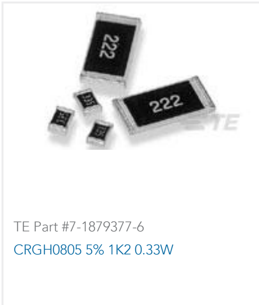
TE Part #7-1879377-6 CRGH0805 5% 1K2 0.33W