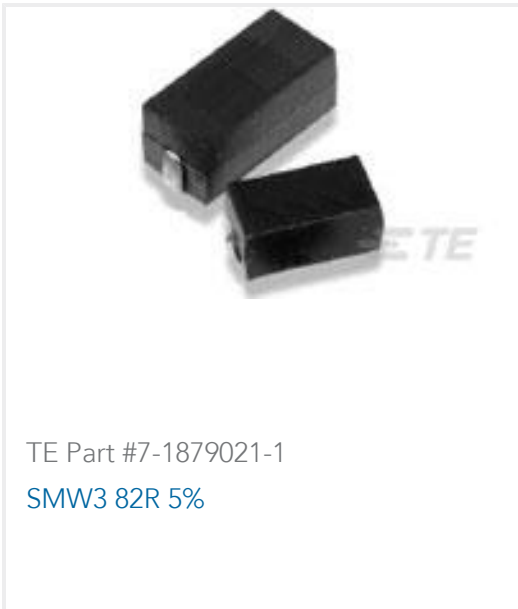
TE Part #7-1879021-1 SMW3 82R 5%