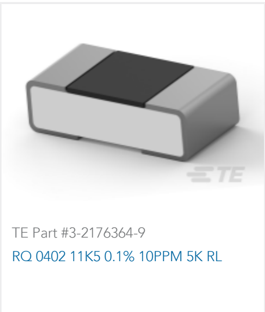
TE Part #3-2176364-9 RQ 0402 11K5 0.1% 10PPM 5K RL