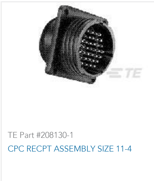
TE Part #208130-1 CPC RECPT ASSEMBLY SIZE 11-4