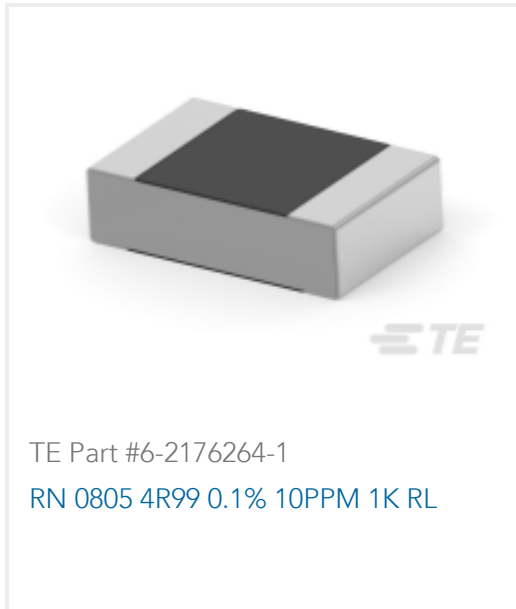
TE Part #6-2176264-1 RN 0805 4R99 0.1% 10PPM 1K RL