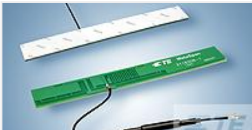
TE Part #2118308-3 4G WORLD BAND, METASPAN, PCB ANT, 150MM