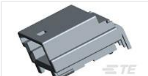
TE Part #1-1355897-1 4pos MQS .63 header 90deg