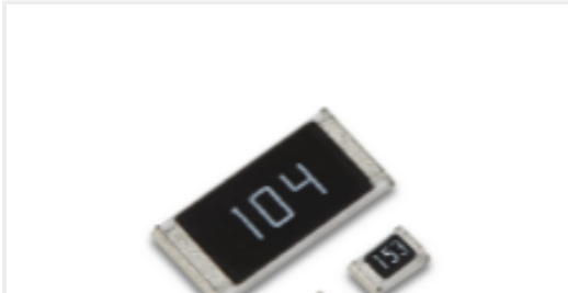
TE Part #3-2176347-7 CRGQ 2010 10K 1%