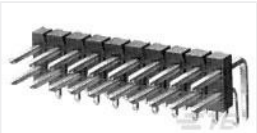
TE Part #826634-5 05P MODU 2 PIN HDR.