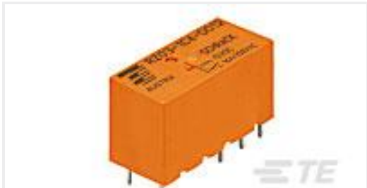
TE Part #1-1415899-0 RZ01-1C4-D012