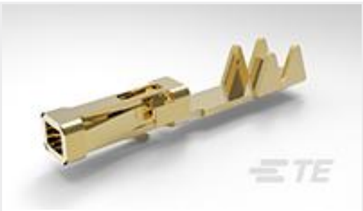
TE Part #2-487406-2 FFC,RCPT CONTACT,STD PRESSURE