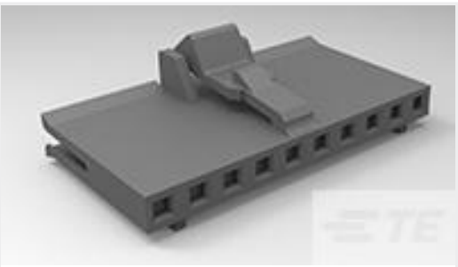
TE Part #487526-3 004 HOUSING FFC RCPT 100CL SR